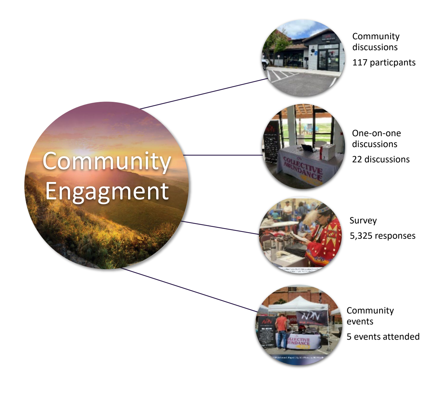
Figure 2. Total Community Engagement by Outreach Method

The community engagement phase was strategically developed in coordination with the Collective Abundance Fund's Regional Advisory Committee; a committee of regional tribal leaders, and non-profit leaders, elected public officials, artists, and knowledge holders. The aim was to ensure broad and inclusive participation from all the tribal communities across the tri-state area through the collective engagement methods. To maximize survey participation, all communications and campaign branding graphics and messaging were developed to highlight the essence of Indigenous culture and the potential of the program's impact. The primary message was to "redefine wealth on our own terms." Figure 2 shows the total community engagement by outreach method.