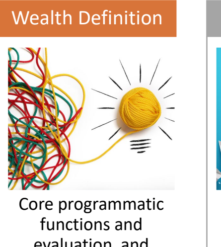
functions and evaluation and centering program values, principles and requirements.