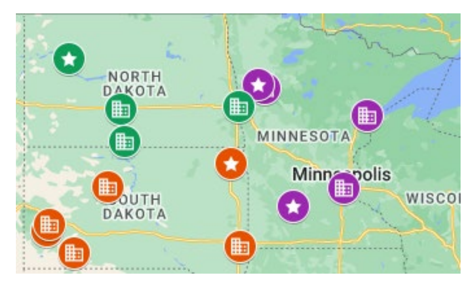
Figure 1. Map of the Tri-state Area of Community Discussion and Event Locations

The primary goal of community engagement in the planning phase of this initiative is to ensure responsiveness and a program model informed by, for, and with the people impacted by the wealth gap. Community engagement launched in May 2022 and concluded in July 2022. Outreach across the tri-state area included a public survey and individual and community discussions with Indigenous participants. Community discussions and events were held in urban, rural-reservation, and community-centric locations across the tri-state area. Figure 1 shows the map of the tri-state area indicating the locations of community discussions (building icon) and events (star icon).