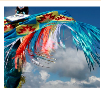
Support individuals and families through the ways and values of Indigenous culture without sacrificing personal autonomy.

Moving forward in the design phase of the Collective Abundance Fund, NDN Collective will use the collective Indigenous definition of wealth to develop core programmatic functions and integrate as part of the program evaluation. NDN Collective can use the concepts of "abundance" and "collective abundance" to support a collective movement away from away from colonial and capitalist frameworks based on