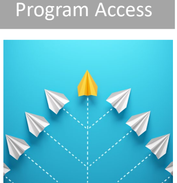
Equitable access by understanding barriers and offering flexibilty to meet people where they are.